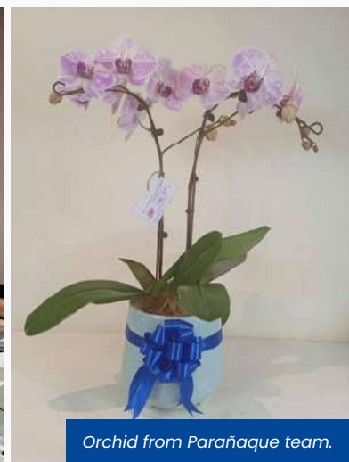
Orchid from Parañaque team.