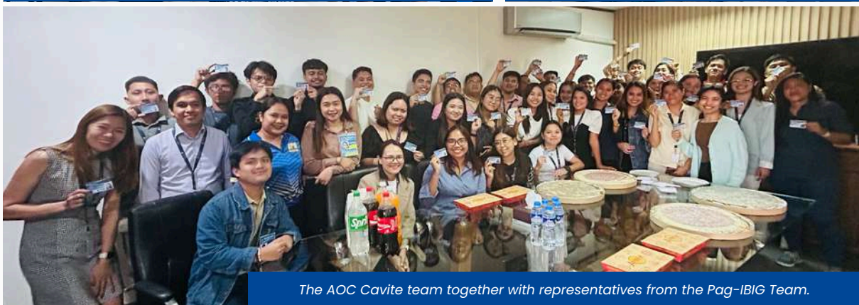
The AOC Cavite team together with representatives from the Pag-IBIG Team.