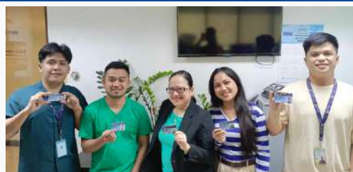
BSU Team with their Pag-IBIG Loyalty Card Plus