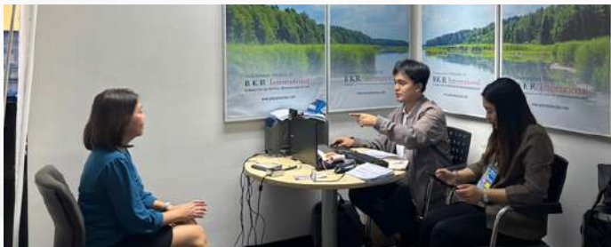
The HR and Payroll team together with representatives from the Pag-IBIG Team during the Loyalty Card Plus registration event.

This successful event not only promoted financial mindfulness but also served as a reminder of the tangible benefits we can enjoy when we actively engage with government programs. Indeed, small steps—like securing a loyalty card—can lead to meaningful, long-term rewards.