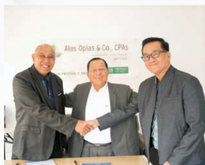
During the meeting and signing of Partners.