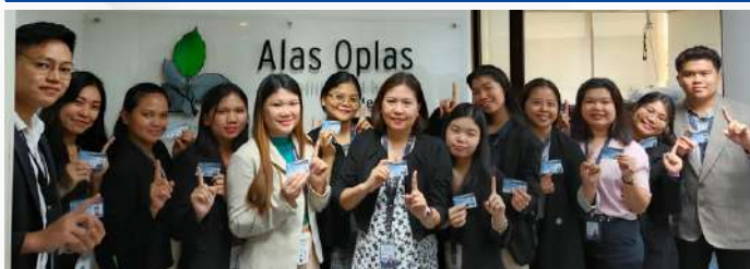
Makati Head Office with their Pag-IBIG Loyalty Card Plus