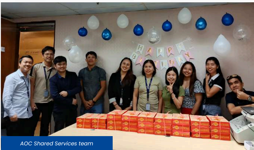
AOC Shared Services team