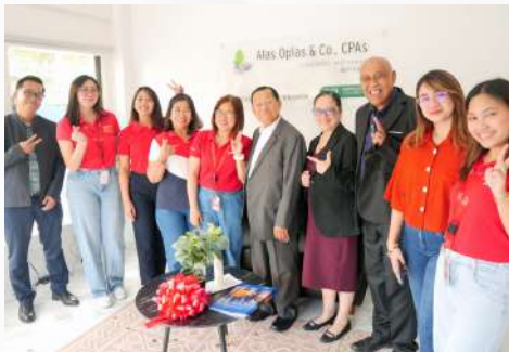
With guests from China Bank, our neighbors in the building.