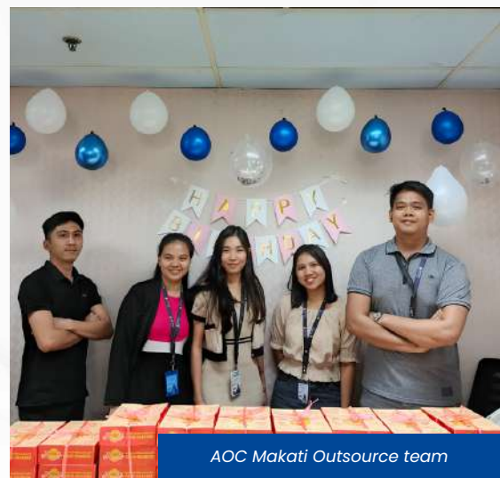
AOC Makati Outsource team