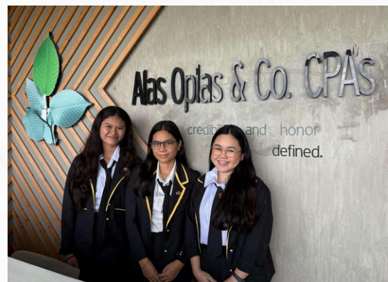
AOC Interns from San Agustin University.