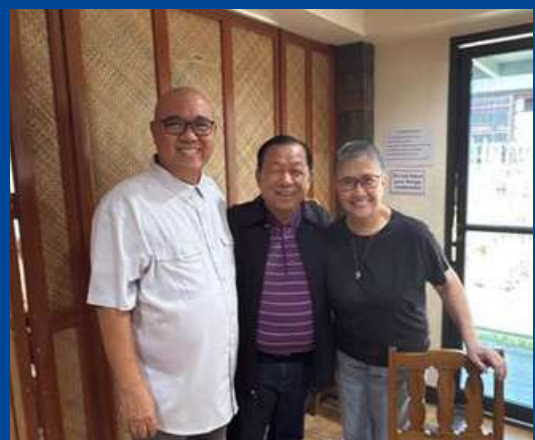
March 13, 2025 at Aboy's Restaurant together with the Owners of the restaurant.