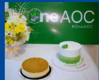
Greeting cakes from valued clients PANDR and Madrid & Almajeda Law Firm added a festive mood to the event.