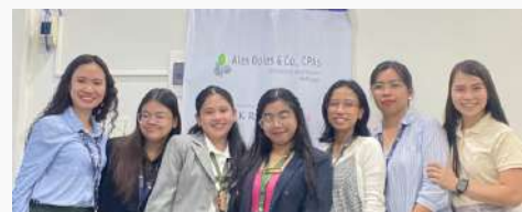
Interns from General De Jesus College together with the AOC Cabanatuan team.