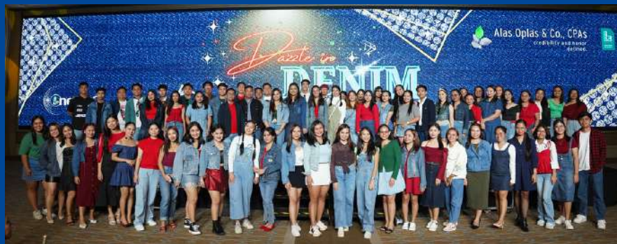
In photo: 2024 New Hires