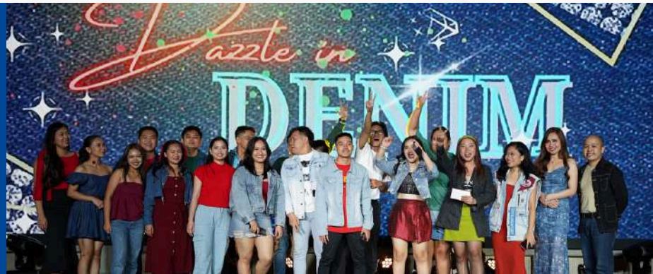
In photo: The Grand Champion, AOC Cavite Branch, receiving their award.