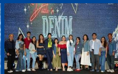
In photo: The event organizers.