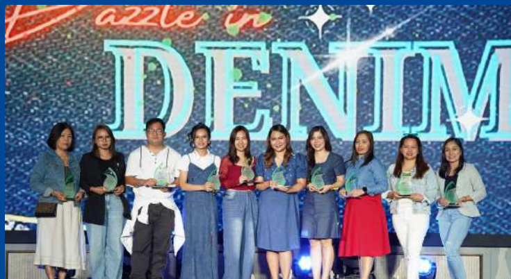
In photo: Service Awardee